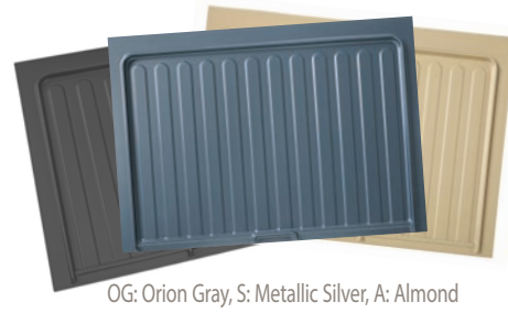
OG: Orion Gray, S: Metallic Silver, A: Almond